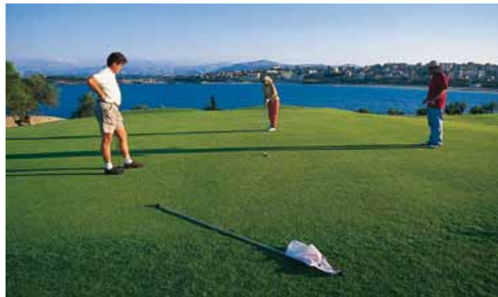
Mataleñas Golf Club (Santander)

Cantabria has several golf courses spread throughout the region, predominantly located in the coastal strip: Mataleñas, Club Parayas, Abra del Pas, Santa Marina, La Junquera, Oyambre, Rovacías, Noja and Ramón Sota. Only Nestares, located in the Campoo region, is not located near the coast. The uniqueness of Cantabrian golf courses is provided by the spectacular scenery that surrounds them, most overlooking the Bay of Biscay, and others with views of impressive massifs like the Picos de Europa. Their facilities include a comprehensive range of services that complement the entertainment and enjoyment of the players of this sport. The most historic course in Cantabria is the Real Golf de Pedreña , opened in 1928, located in the town of Pedreña, off the Bay of Santander, internationally known as the place where the legendary Severiano Ballesteros trained.