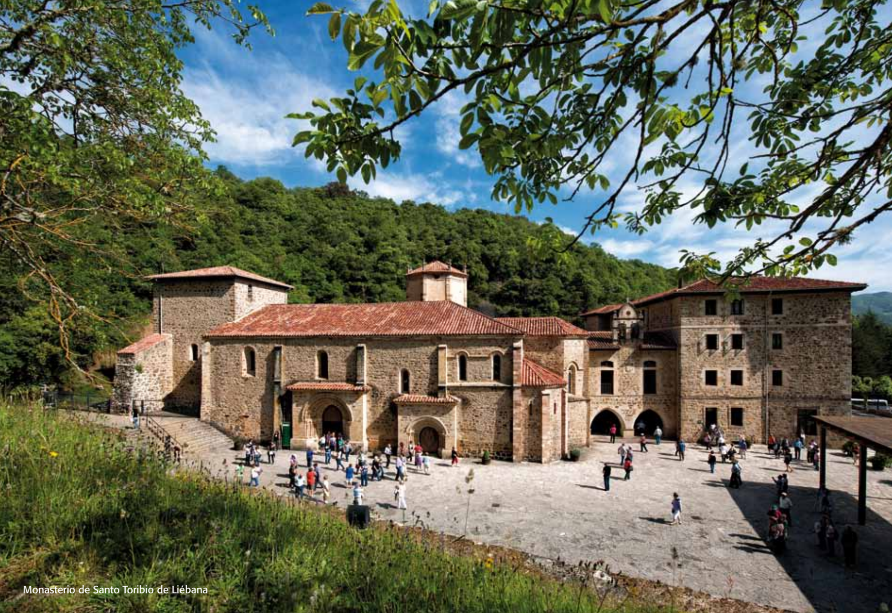
Monasterio de Santo Toribio de Liébana