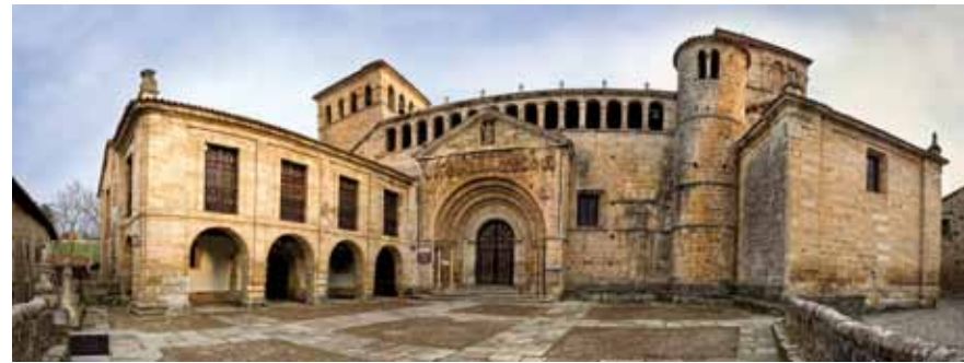
Collegiate church of Santa Juliana (Santillana del Mar)

Fine examples of the former include the Neo-Gothic palace of Sobrellano and the modernist building, El Capricho , by Gaudí, both in Comillas; or the baroque palaces of Soñanes, in Villacarriedo, and Elsedo, in Pámanes. In the second category, there is the King's Castle in San Vicente de la Barquera, the castle-lighthouse of Castro-Urdiales, and Argüeso Castle (the only non-coastal castle in Cantabria), or towers like Linares, Estrada, or Pero Niño, in Llano. Outstanding examples of religious architecture include the Mozarabic church in Lebeña, the beautiful Romanesque collegiate churches in Santillana del Mar, Castañeda, Cervatos and San Martín de Elines, and the Gothic Church of Castro-Urdiales.