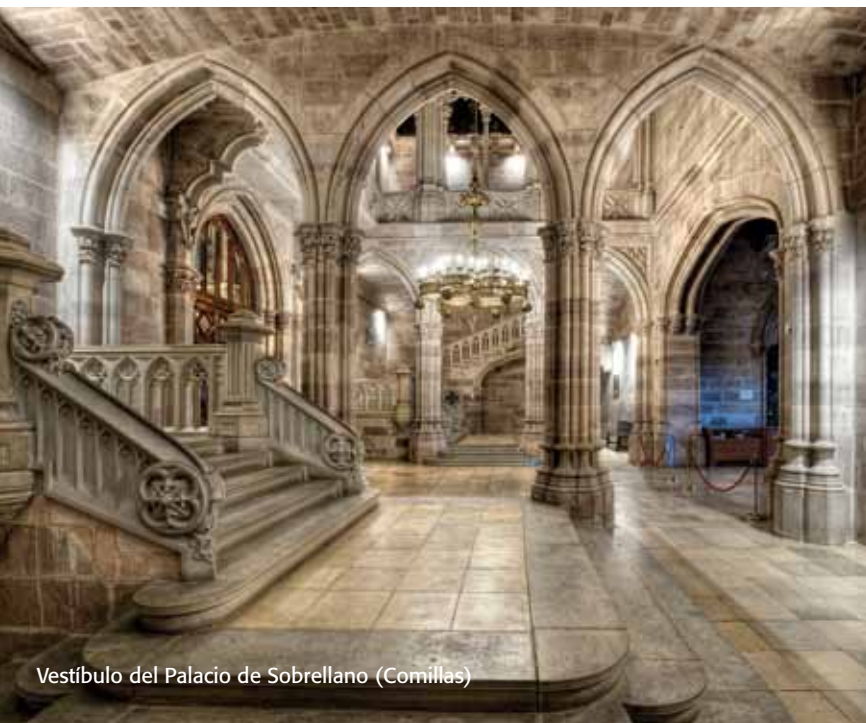
Vestibulo del Palacio de Sobrellano (Comillas)

Its ancestral isolation, caused by its rugged topography, has enabled it to maintain its own special characteristics as well as a Mediterranean micro-climate with crops such as grapes and cork oak trees. The capital, Potes, is the starting point to visit the monastery of Santo Toribio or the Fuente Dé cable car in the Picos de Europa , its two main tourist attractions.