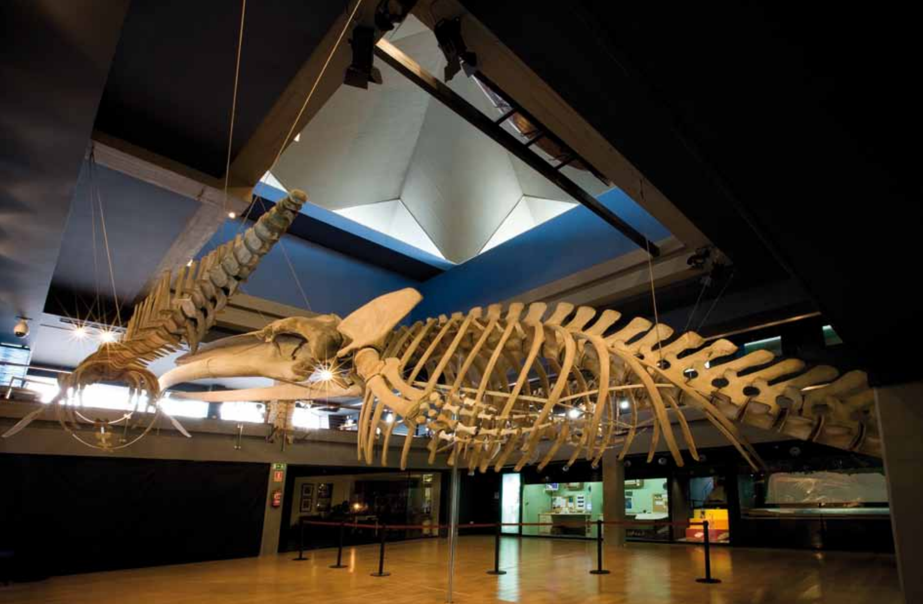
Museo Marítimo del Cantábrico (Santander)