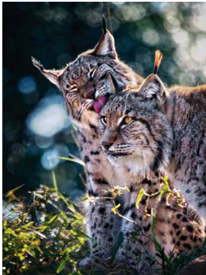
Pair of lynxes

One of the main objectives of the park is to carry out programmes of conservation and reproduction of endangered species of animals such as the African elephant, the tiger, the brown bear, the gorilla, the European bison and the white rhino.