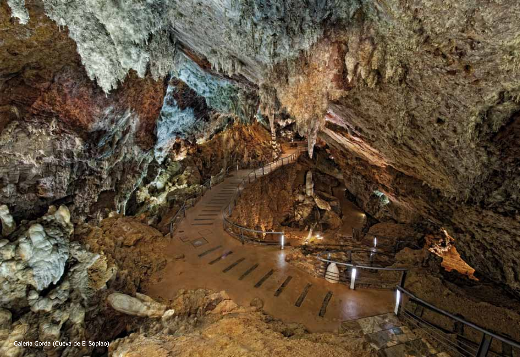
Galería Gorda (Cueva de El Soplar)