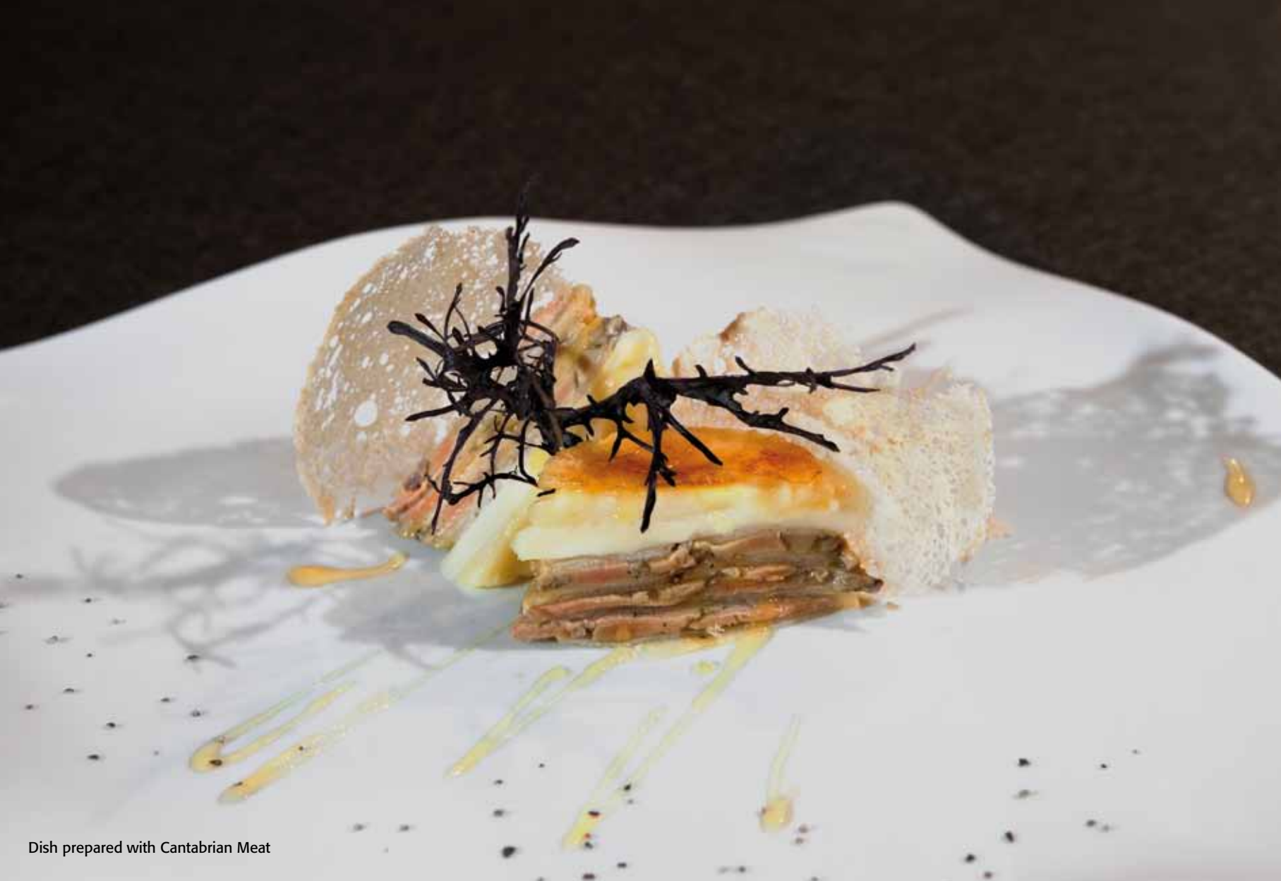
Dish prepared with Cantabrian Meat