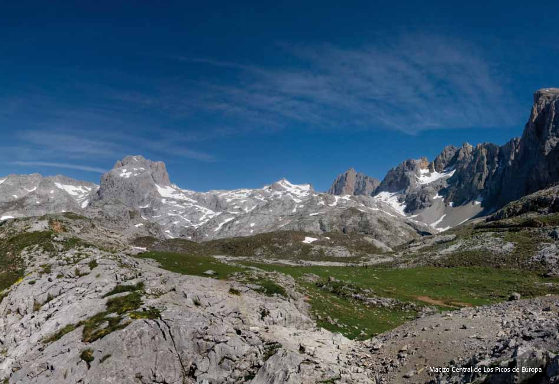
Macizo Central de Los Picos de Europa