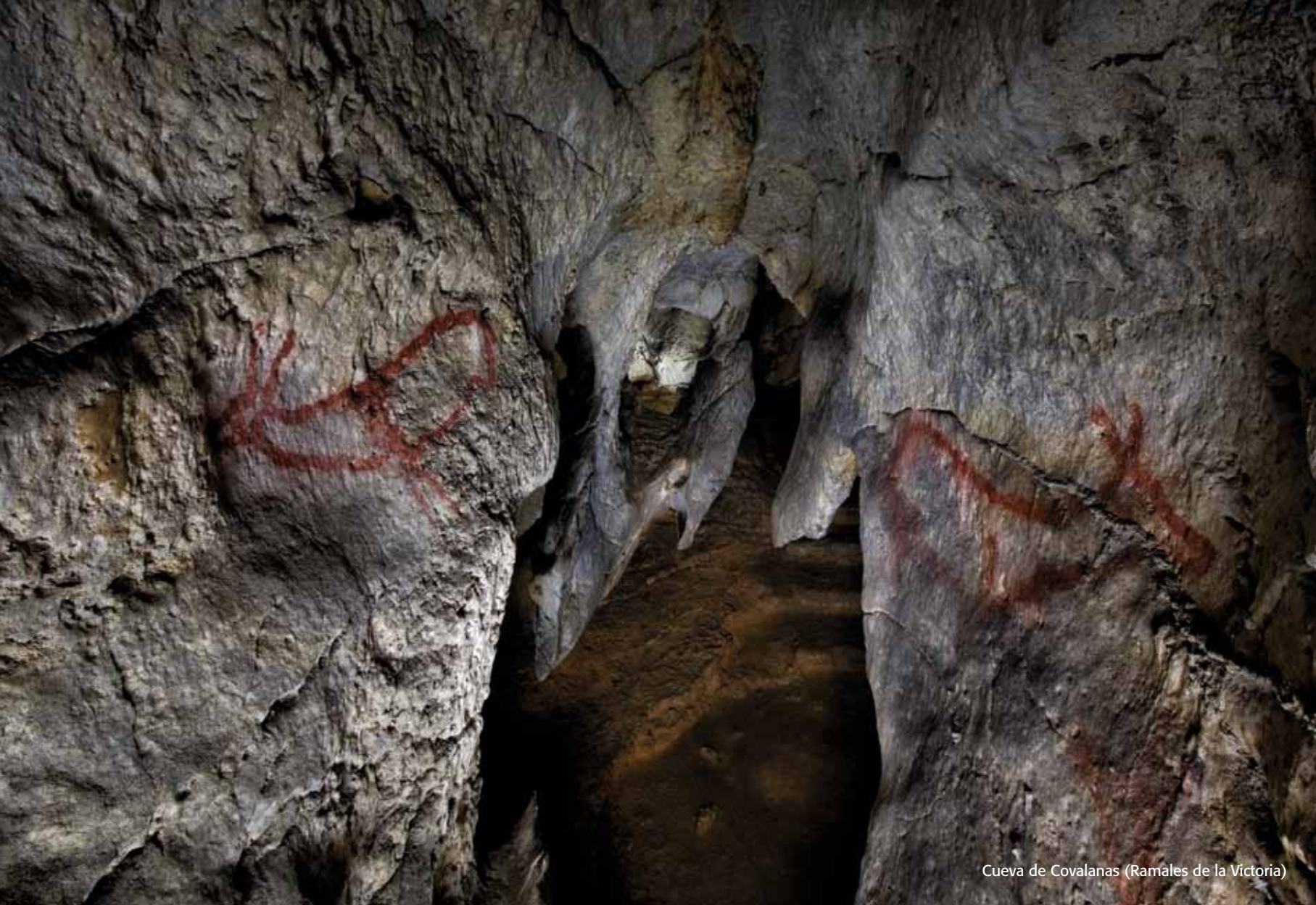
Cueva de Covalanas (Ramales de la Victoria)