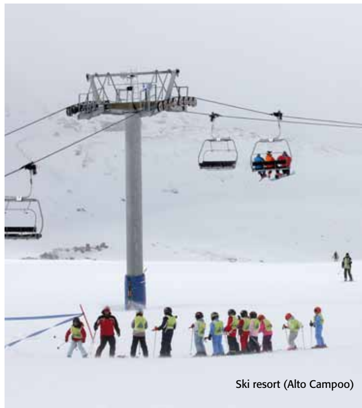
Ski resort (Alto Campoo)

tions), in Rábago, which is accessed by a mining train, or the Peñacabarga camera obscura , offer unforgettable experiences for children.