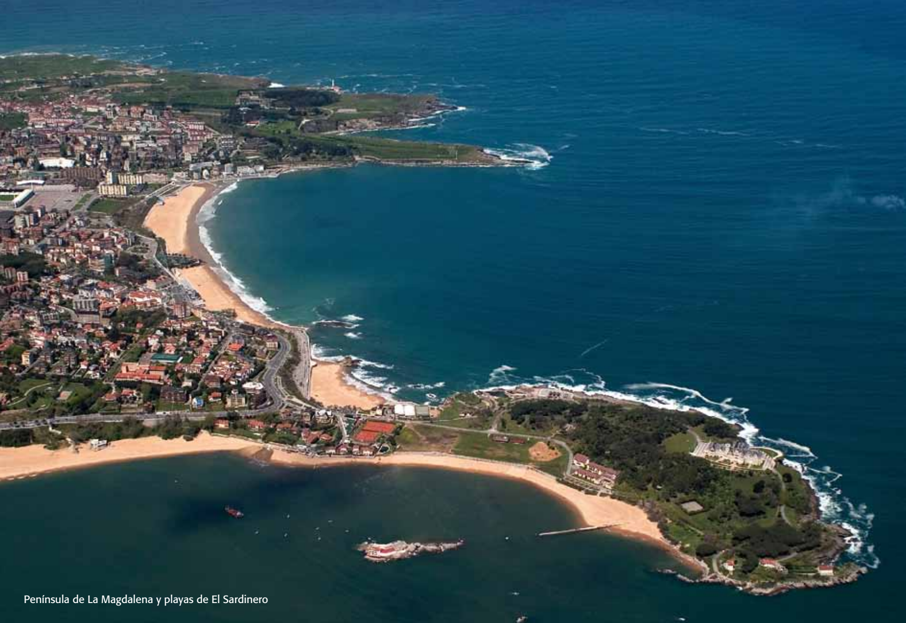
Península de La Magdalena y playas de El Sardinero