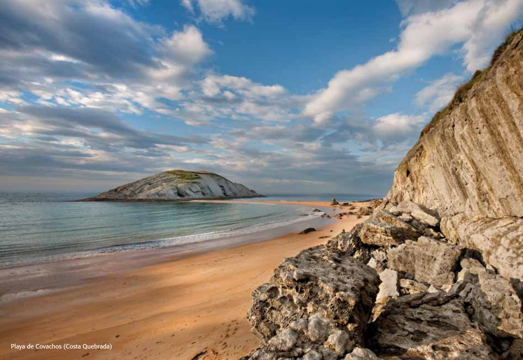
Playa de Covachos (Costa Quebrada)