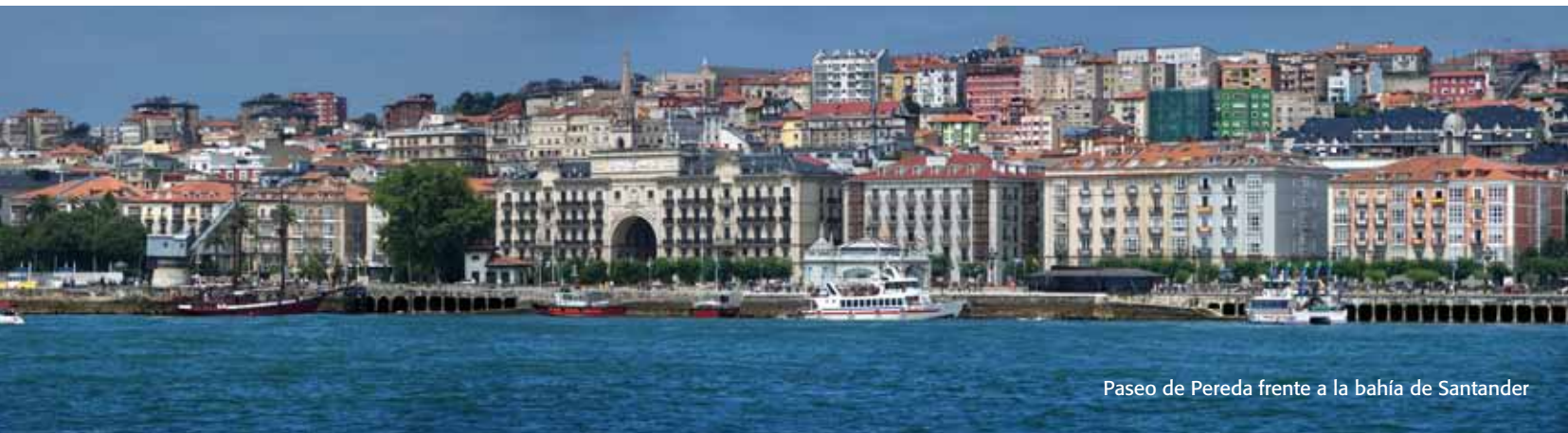
Paseo de Pereda frente a la bahía de Santander

Its elegant promenades and avenues ( Pereda , Castelar or Reina Victoria ) offer visitors the charm of a city that has managed to combine tradition and modernity, where nature plays the lead role in any space. The city has a rich and varied cultural and artistic heritage to enjoy every day of the year. However, two events have marked the cultural development of Santander in recent decades: the Menéndez Pelayo International University and the International Festival of Santander , events of great significance that have projected the image of the city outside our borders. All these qualities, along with many others (unique scenery and large number of hotels), have succeeded in making the Cantabrian capital one of the favourite destinations in Spain for organizing all kinds of professional, social or sporting events. Proof of this is the upcoming 2014 World Sailing Championship in the waters of the bay.