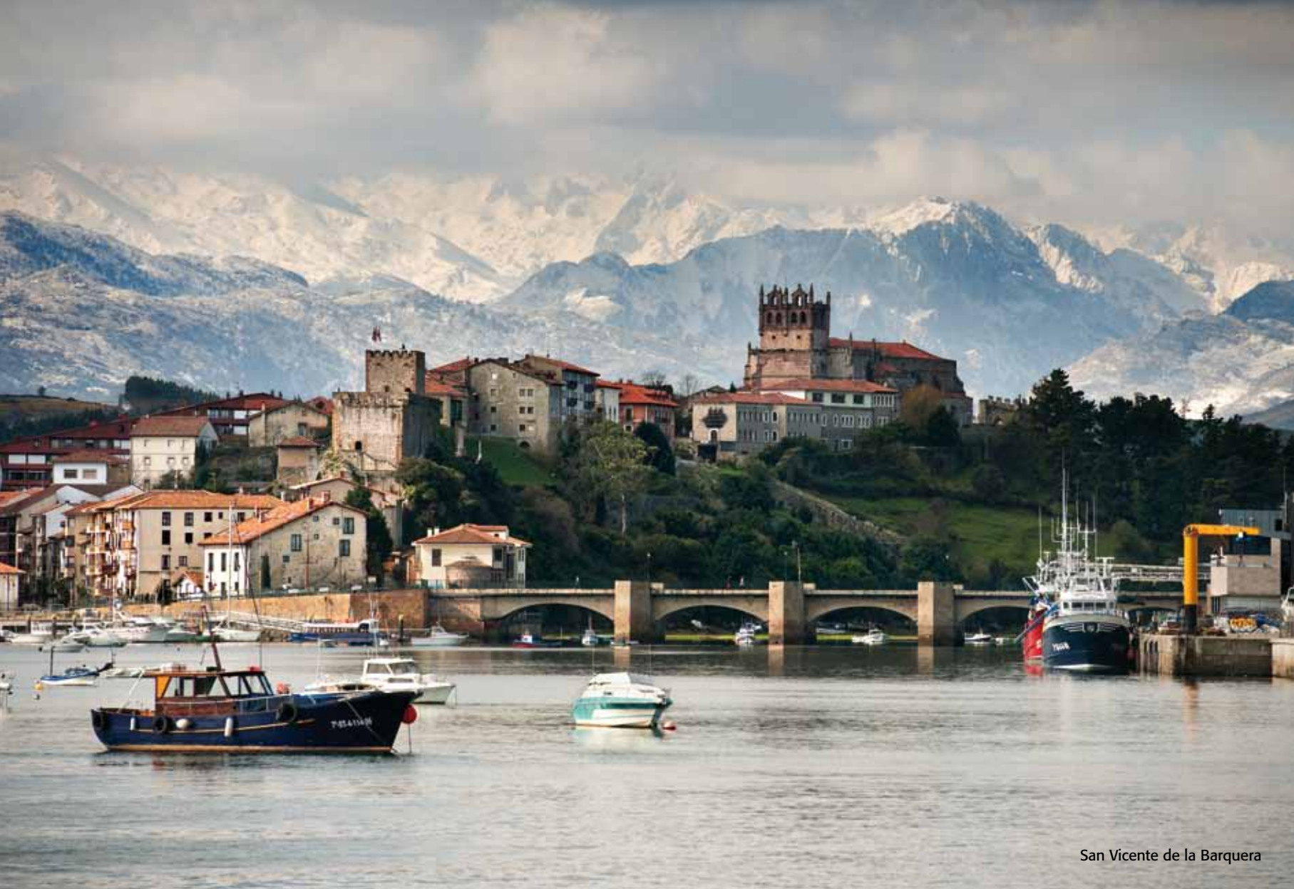
San Vicente de la Barquera