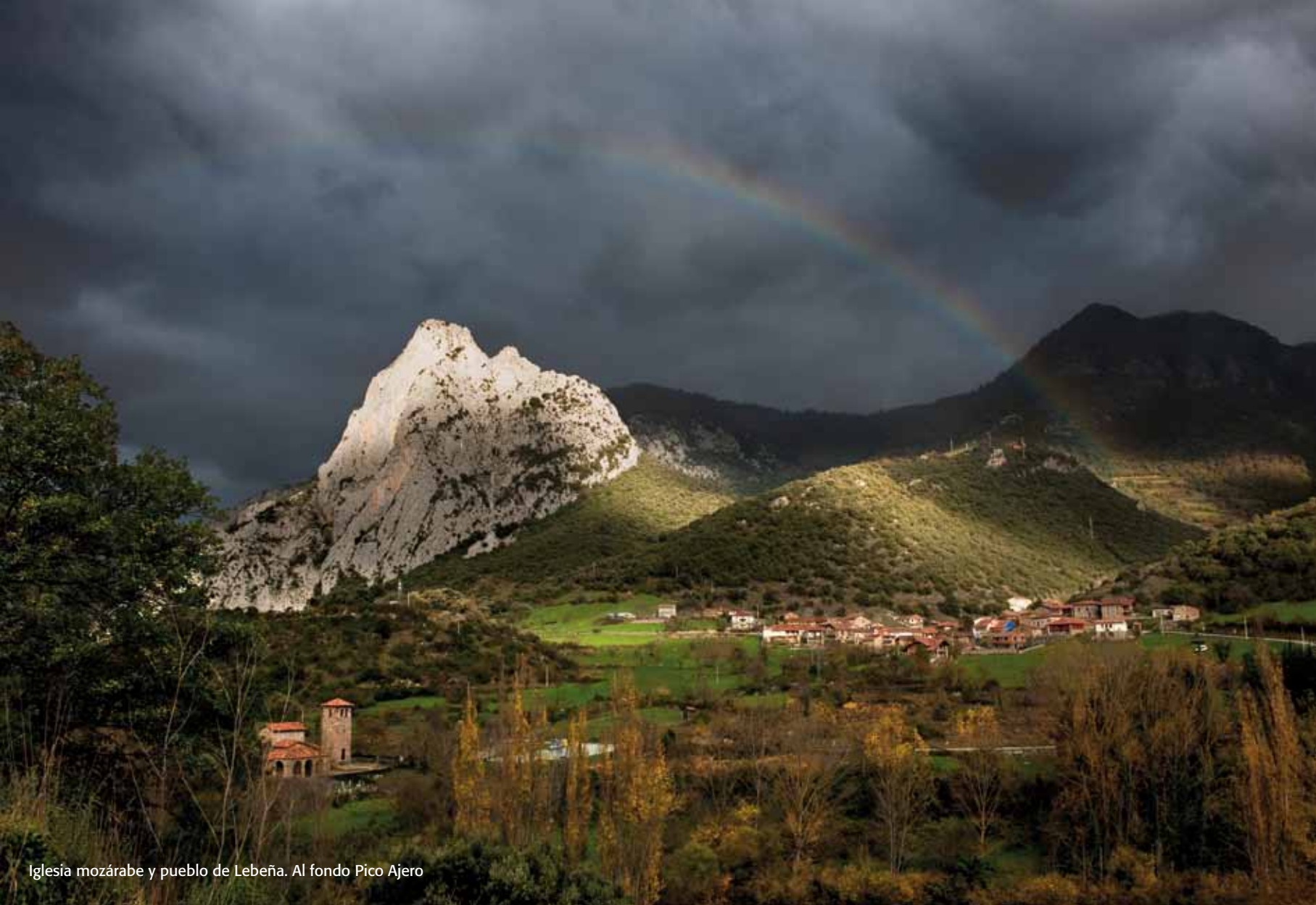
Iglesia mozárabe y pueblo de Lebeña. Al fondo Pico Ajero